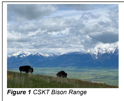
Figure 1 CSKT Bison Range